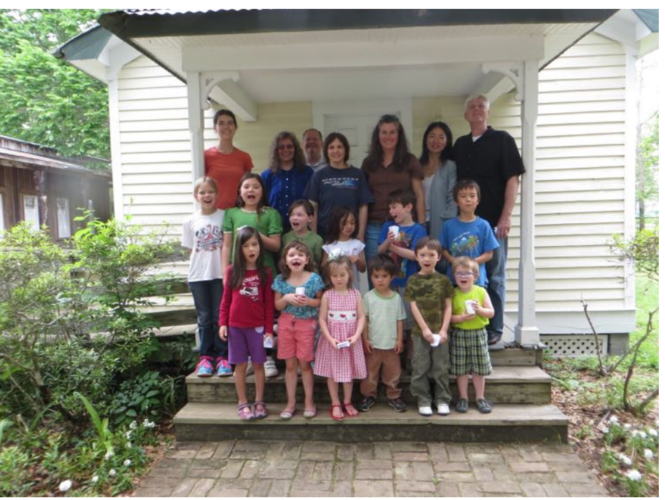
Photo 10: Homeschool group at the West Bay Common School Children's Museum, League City, TX [Apr 22]