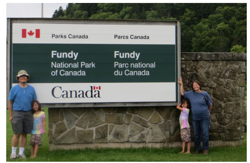
Photo 24: Fundy National Park sign, New Brunswick, Canada [Jul. 28]