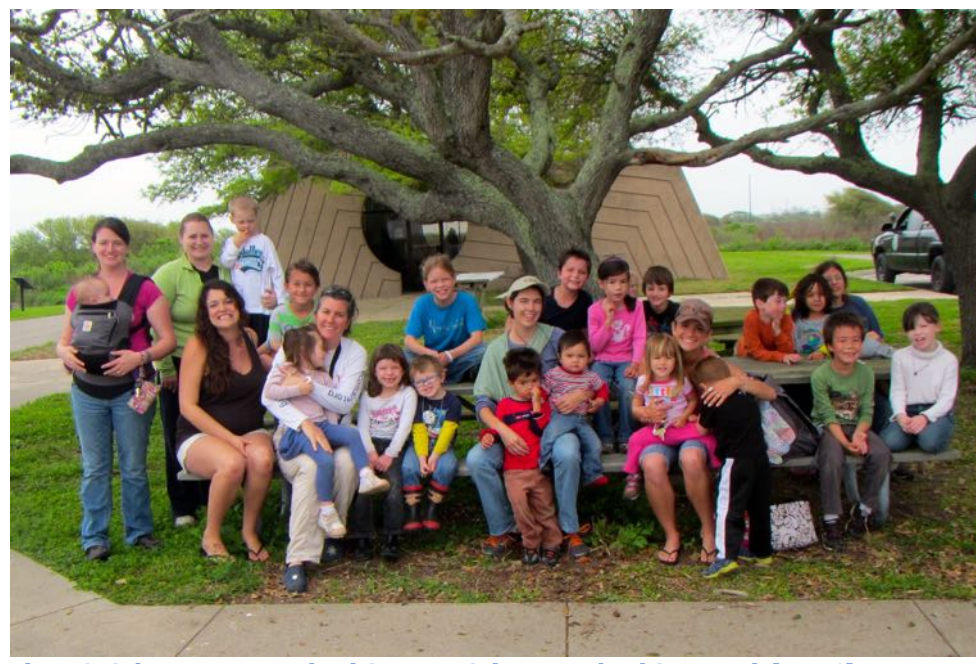
Photo 8: Galveston Homeschool Group at Galveston Island State Park [Apr. 1]