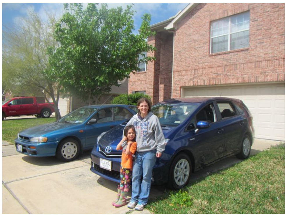
Photo 32: Our new 2014 Toyota Prius V 3, and 1997 Subaru Impreza [Mar. 31]