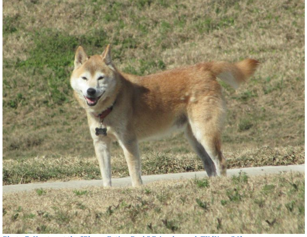
Photo 7: Hunter at the "Phone Eating Park" Friendswood, TX [Nov. 26]